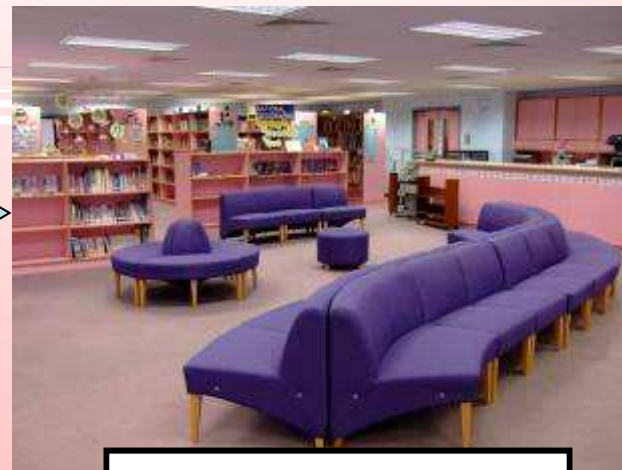
The new library