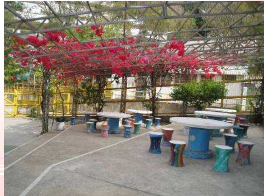
Inviting resting place for students