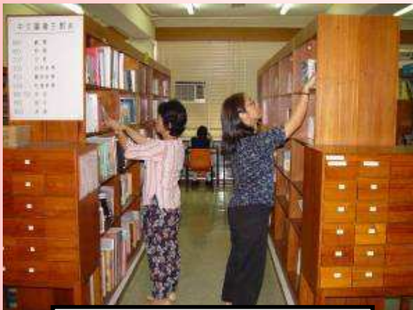
The old library