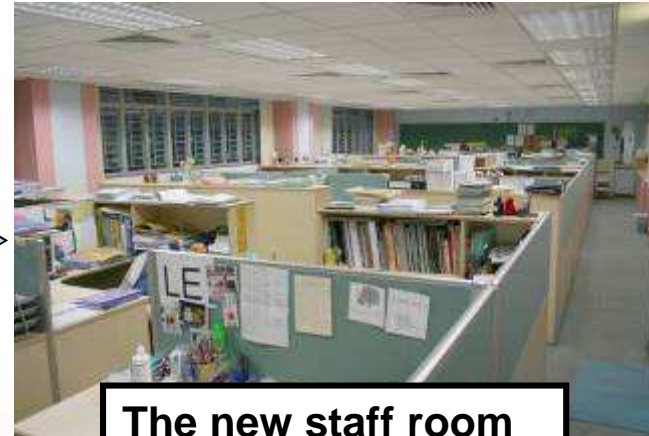
The new staff room