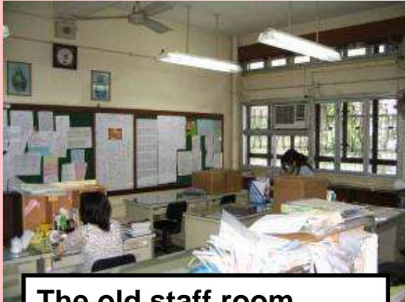
The old staff room