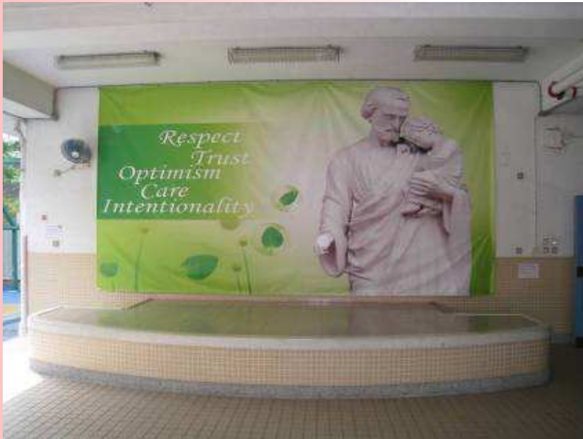
A new stage for mini show