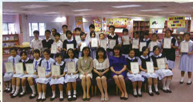
2009 - 2010 Gold Award Winners

aloud to a teacher or Student Ambassador. Our NETs also pre-record each text, and students are shown how to access the recordings on the e-class, in order to improve their delivery. Students can earn up to 3 marks and enter the Award Scheme with Gold, Silver and Bronze Awards given at the end of the school year. Last year, 37 Gold, 28 Silver and 45 Bronze awards were presented to S1 and S2 students. Check out the happy faces of the Gold Award Winners in the photo. Thanks go to all English teachers and students for their participation!