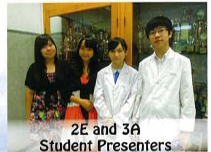
2E and 3A Student Presenters

Our annual Diocesan Schools Talent Show was held on 5 May 2012. Different from most schools that joined the category of music and drama, our school had an innovative performance of a science presentation featuring both music and skits. It was a great success and we were awarded the third runner-up. Both students and teachers enjoyed the show so much that we would happily perform it again given the chance.