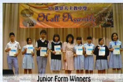
Junior Form Winners