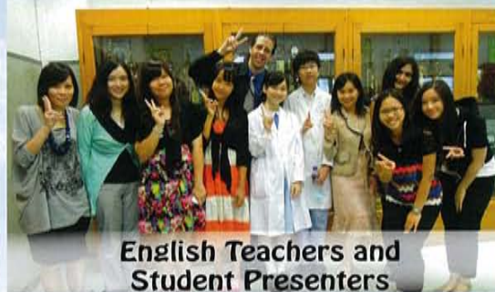
English Teachers and Student Presenters

This cross-curricular presentation on healthy eating was composed of language arts elements, like rhyming words. Many people enjoy eating junk food and it has been a hot issue in many countries for the health problems it brings. In order to know more about the drawbacks of junk food and how to choose healthy food, four students took turns to take the audience through a journey to the world of healthy food. They explained what obesity and anorexia are and how people could stay healthy through a strong diet.