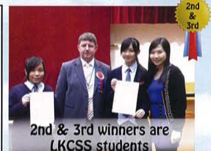
2nd & 3rd winners are LKCSS students