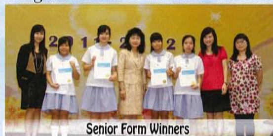
Senior Form Winners

LKCSS had 101 entries in this year's Solo Verse Speaking, Public Speaking and Choral Speaking competitions. A total of 143 students from S.1 to S.7 participated in the 63rd Speech Festival. It is again our pride to announce the promising and encouraging results from our students. Of all the participants, we earned 4 second place and 10 third place awards, along with 99 entries (95 individual performers, 3 duologue performers, and 1 choral speaking group) earning 87 Certificates of Merit and 14 Certificates of Proficiency. Such glorious results serve as inspiring demonstrations of our students' linguistic abilities, creativity, as well as the concerted effort of our teachers. Congratulations to all winners and teacher trainers!