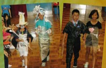
Students at Fashion Show

The above mentioned activities gave our students an amazing experience, from choosing fabrics for their fashion show to writing a script for their English drama performance in the Grand Closing Ceremony. We found our students to be very creative and imaginative.