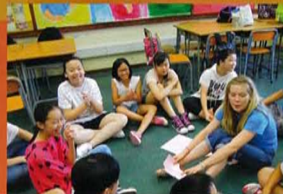
Tutors and our new S1 students