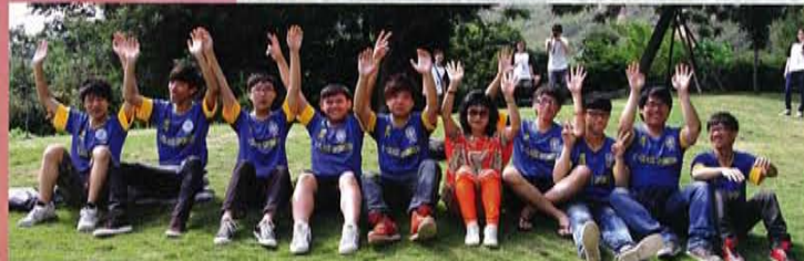
Students and Teachers enjoyed the walkathon a lot!