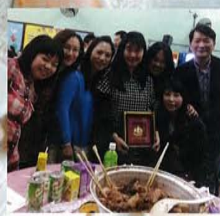
Past students at Poon Choi Feast