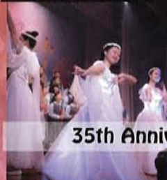
35th Anniversary Mass and Celebration