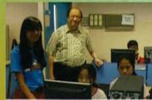
Students doing research in the Computer Lab