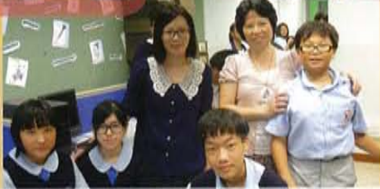
English Society First Gathering