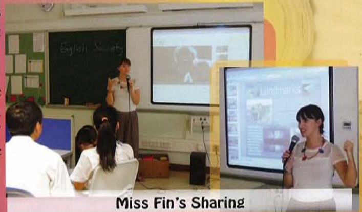
Miss Fin's Sharing

Miss Fin's sharing session not only provided a valuable chance to expose students to the different culture of an English speaking country, it also nurtured students' confidence in speaking English in a pressure-free gathering!