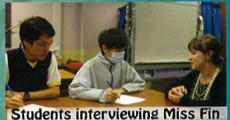
Students interviewing Miss Fin