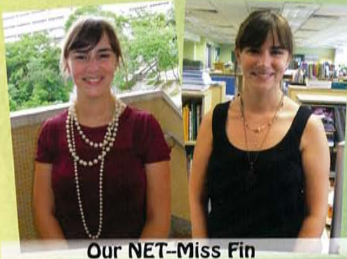
Our NET-Miss Fin