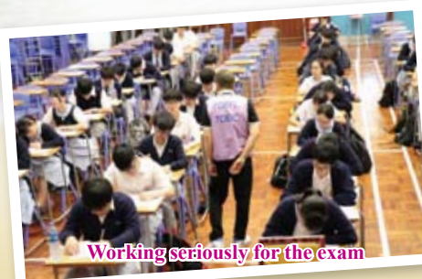
Working seriously for the exam

119 S5 students took the TOEIC Listening and Reading Exam on 17 th April, 2019. All participating students received a reply slip and a certificate to evaluate their performance and recognize their English proficiency in June. As an assessment for learning measure, the TOEIC exam not only offers our S5 students a chance to experience the authentic public exam setting, but also provides meaningful feedback about the students' strengths and weaknesses at various levels. This will help students make the most of the remaining time to prepare for HKDSE English language exam.