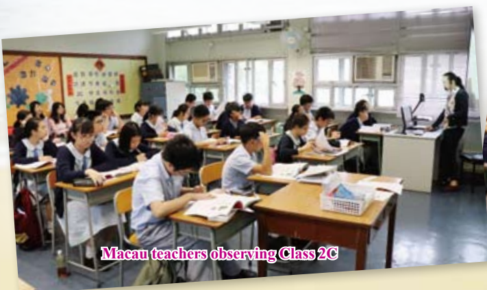
Macau teachers observing Class 2C