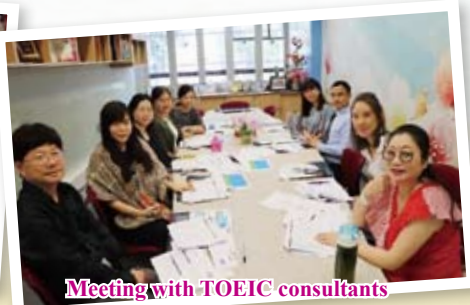
Meeting with TOEIC consultants