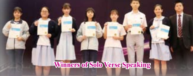
Winners of Solo Verse Speaking

嘉景天主教中學 LAI KING CATHOLIC SECONDARY SCHOOL