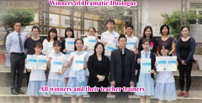
All winners and their teacher trainers