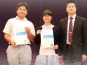
Winners of Dramatic Duologue