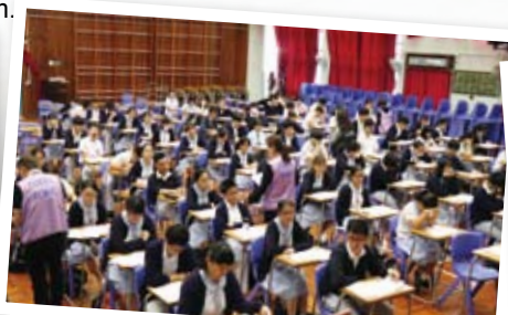
S5 students getting ready for the TOEIC exam