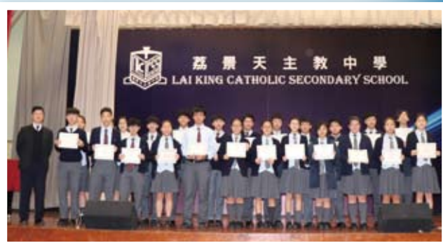
TOEIC Exam Certificate Presentation