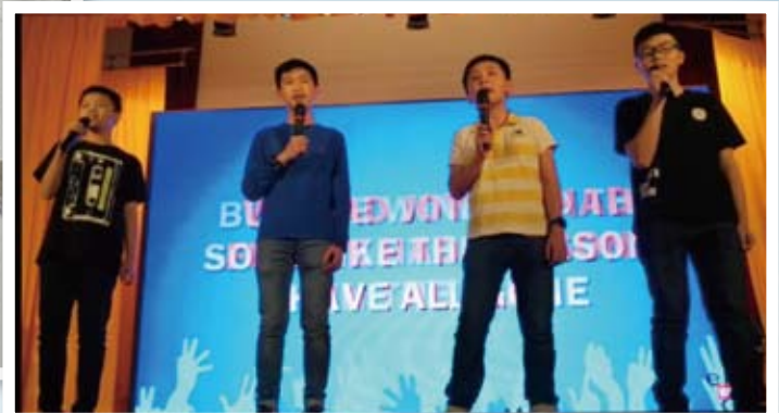
Talent Show participants Singing 'Seasons in the Sun'