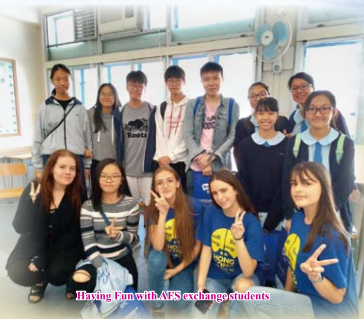
Having Fun with AFS exchange students

Students had a lot of fun attending this event and learning about different countries they normally wouldn't have had the chance to. At the end of the event, students voted for their favorite country and took lots of photos to capture the lovely memories of the day.