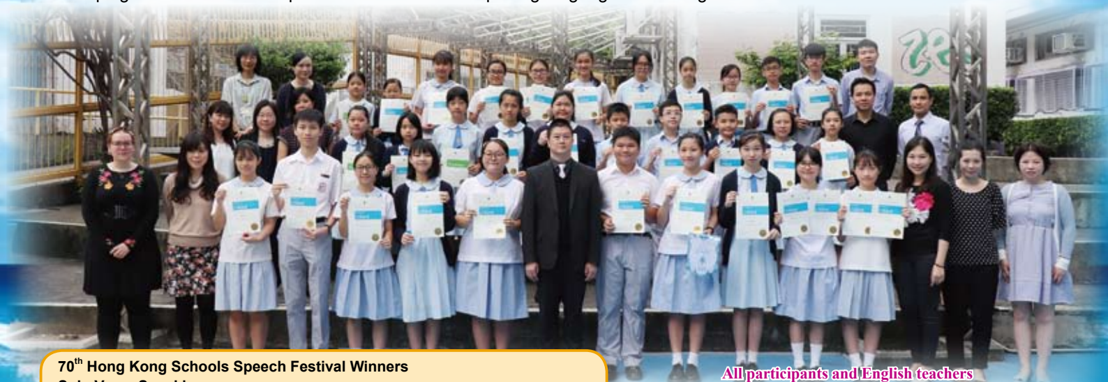
All participants and English teachers

Our students' passion for language arts has always been shown in the active participation in the Hong Kong Schools Speech Festival. This year, we had 35 entries for Solo Verse Speaking and Dramatic Duologue. We are proud to announce that our students were awarded 2 champions, 3 second places, 5 third places and many certificates of merit in the Festival. This is truly a remarkable achievement of our students. Special thanks must be given to our English teachers who have devoted much time to helping our students develop their confidence in interpreting language arts in English.