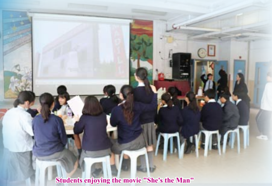
Students enjoying the movie "She's the Man"