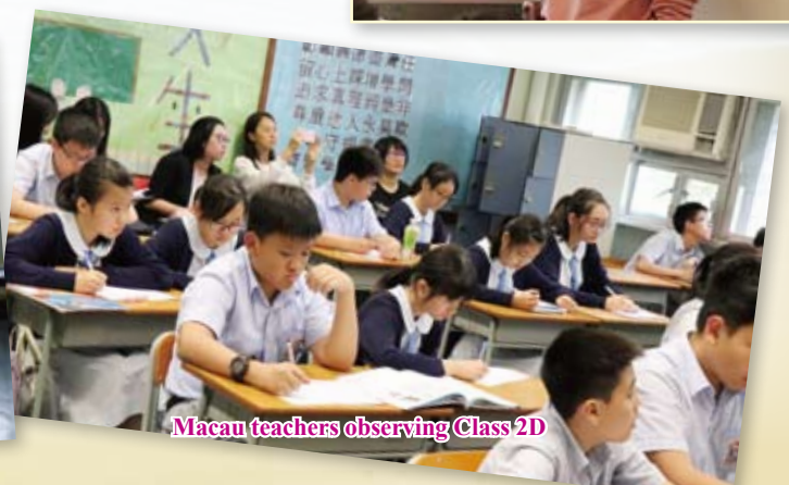
Macau teachers observing Class 2D